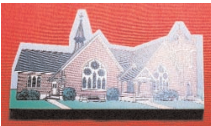
Mary Dod Brown Memorial Chapel $20

(Items come in gift box with history of building on the back.)