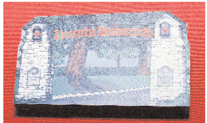
Lincoln University Alumni Arch $16

**For more sale items, see the University's Web site at www.lincoln.edu