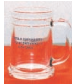
Glass Mug (Clear) $6

*Tee shirts and sweatshirts are also available in other sizes.