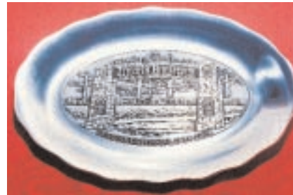
Oval Bread Tray $38