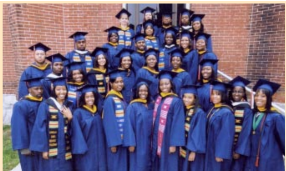
Baccalaureate recipients stand outside of Mary Dod Brown Memorial Chapel.