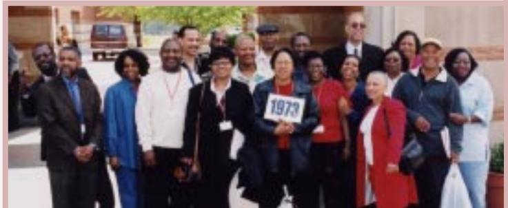
The Class of 1973 ranks third in alumni giving as of May 3.