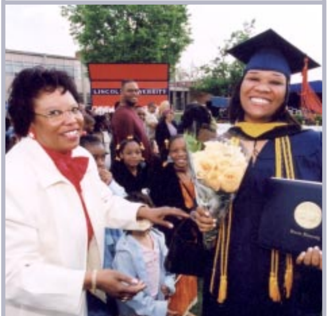
A proud Lincoln graduate and her mother celebrate during the 144th Commencement.