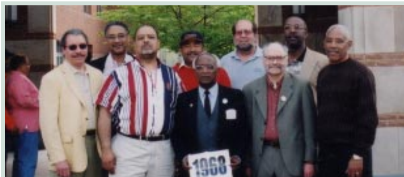
As of May 3, the Class of 1968 ranked fourth in giving for alumni classes ending in the 3s and 8s.