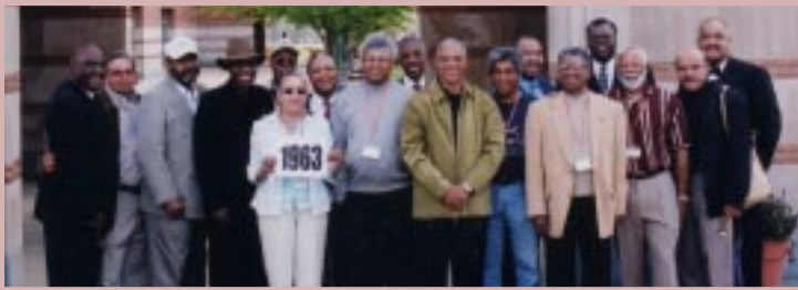
The Class of 1963 was the top donor group as of May 3.

for your convenience is a gift envelope. You may also call the Office of Development and External Relations at (800) 726-3014 to make your contribution by credit card. Hurry because the race is on. Here's a look at the top alumni class gifts for classes ending in the 3s and 8s as of May 3, 2003: