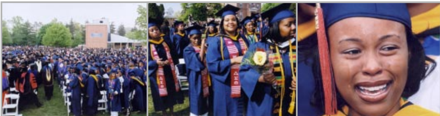
Lincoln faculty, administration and members of the Class of 2003 during and at the close of the 144th Commencement ceremonies.