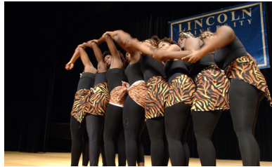
Students perform African-inspired dance as part of Founder's Day Tribute

and vision. Sessions included: The Recruitment Partnership, Your Alumni Relations Office – The Details Of A Vital Partnership, Partnering With Career Services, Establishing the University Brand, and lastly, an Open Leadership Forum.