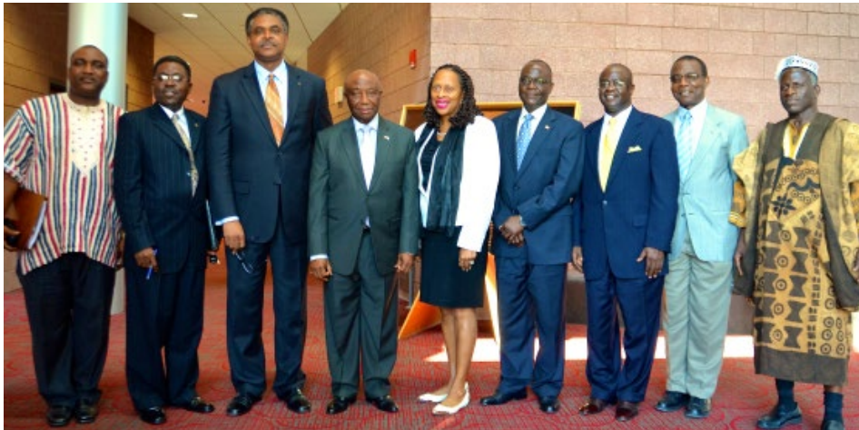
Members of Liberian delegation pose with university officials.