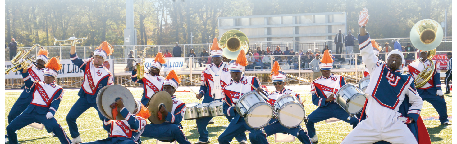
Orange Crush Roaring Lions Marching Band Performs in 2014

The Orange Crush Roaring Lion Marching Band makes history this month in Atlanta when it competes in the final Invitational Showcase of the 2016 Honda Battle of the Bands (HBOB).