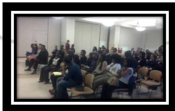
Lincoln University students attending Viacom event.