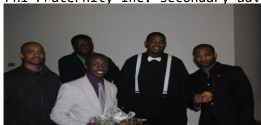
2013-2014 McRary Hall Staff