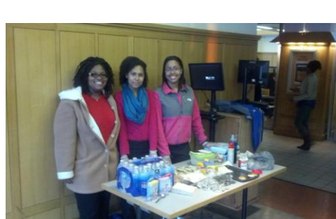
LLC South RHA

Many of our RHA members have gone on to become Student Government Association Officers, Resident Advisors (RA's), members of Greek Organizations, Student Leader Ambassadors (SLA's), and Student Activities Assistants (SAA's)