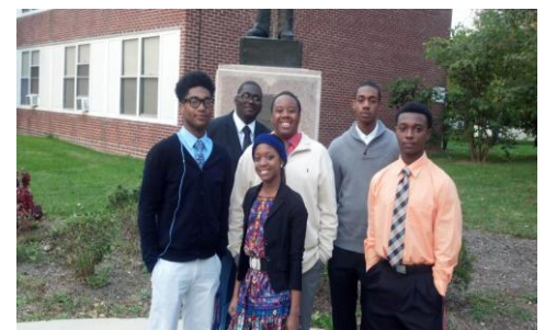
Frederick Douglass RHA