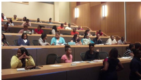
The 2013-2014 RA's at RA training