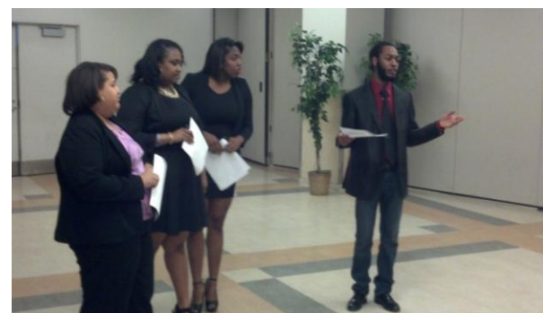
Apartment Style Living RHA