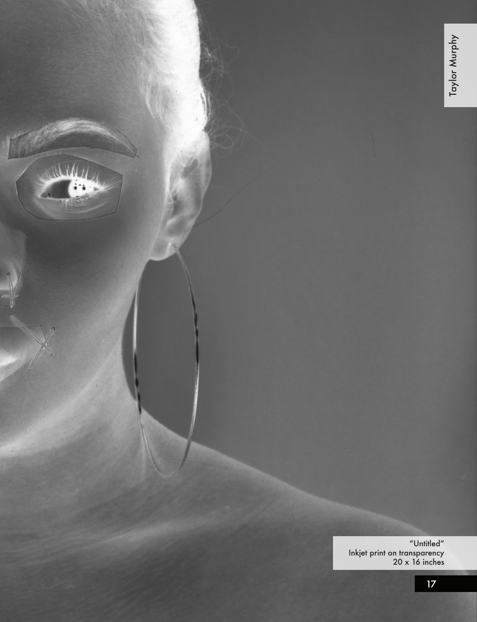
"Untitled" Inkjet print on transparency 20 x 16 inches