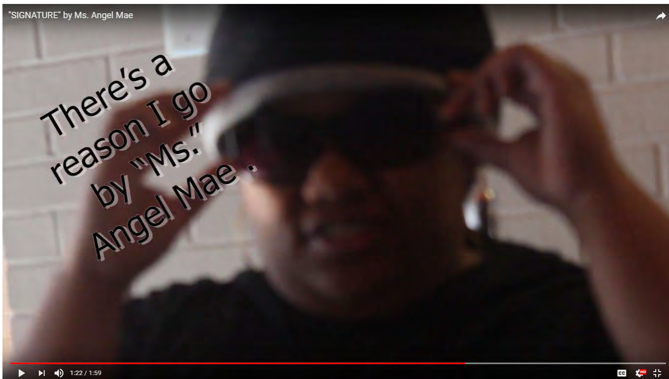
Stills from "Signature" Digital Video