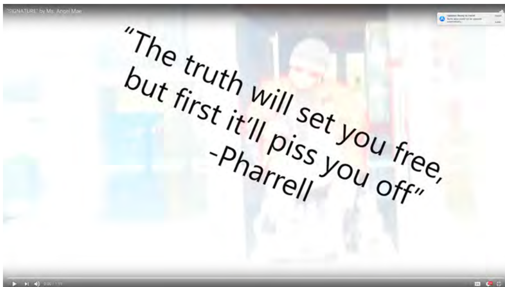
Stills from "Signature" Digital Video