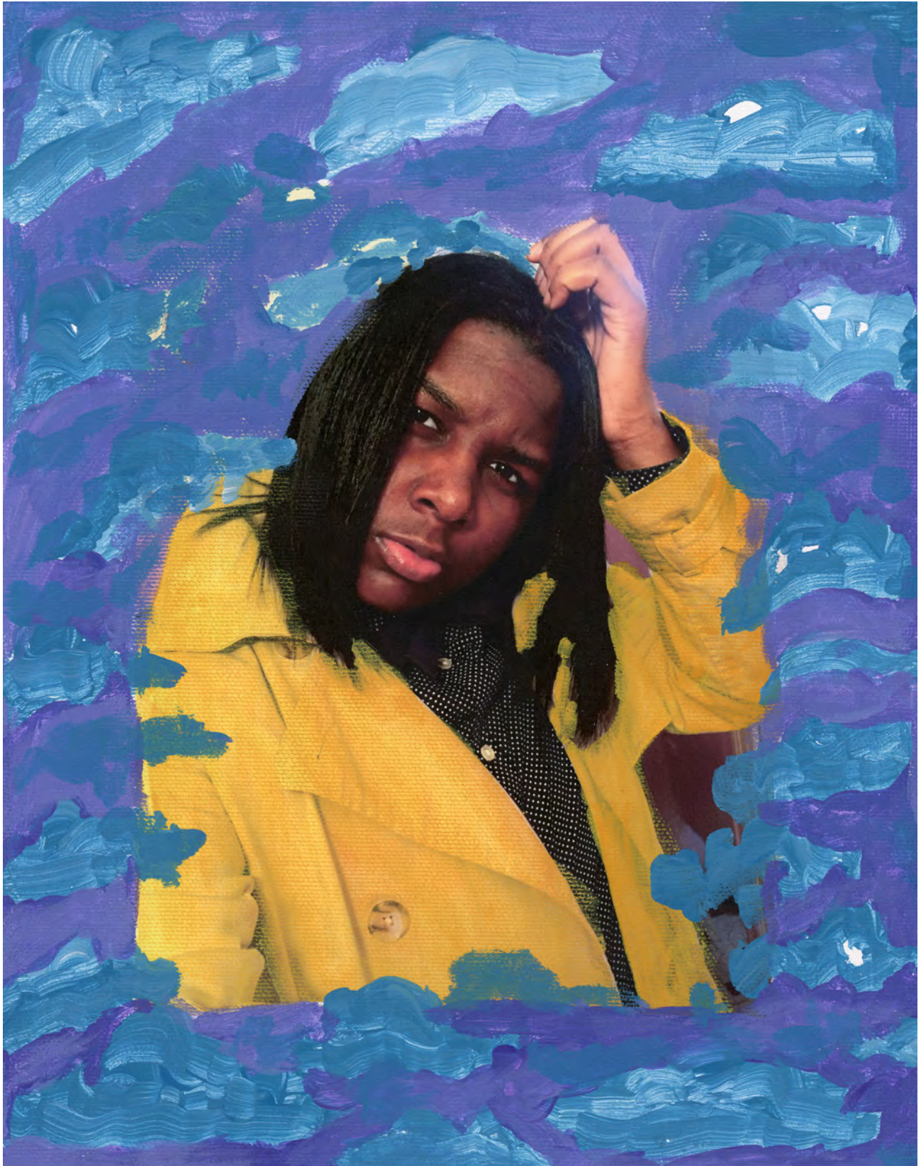
"Head in The Clouds" Acrylic and Inkjet on Canvas 8.5 x 11 inches