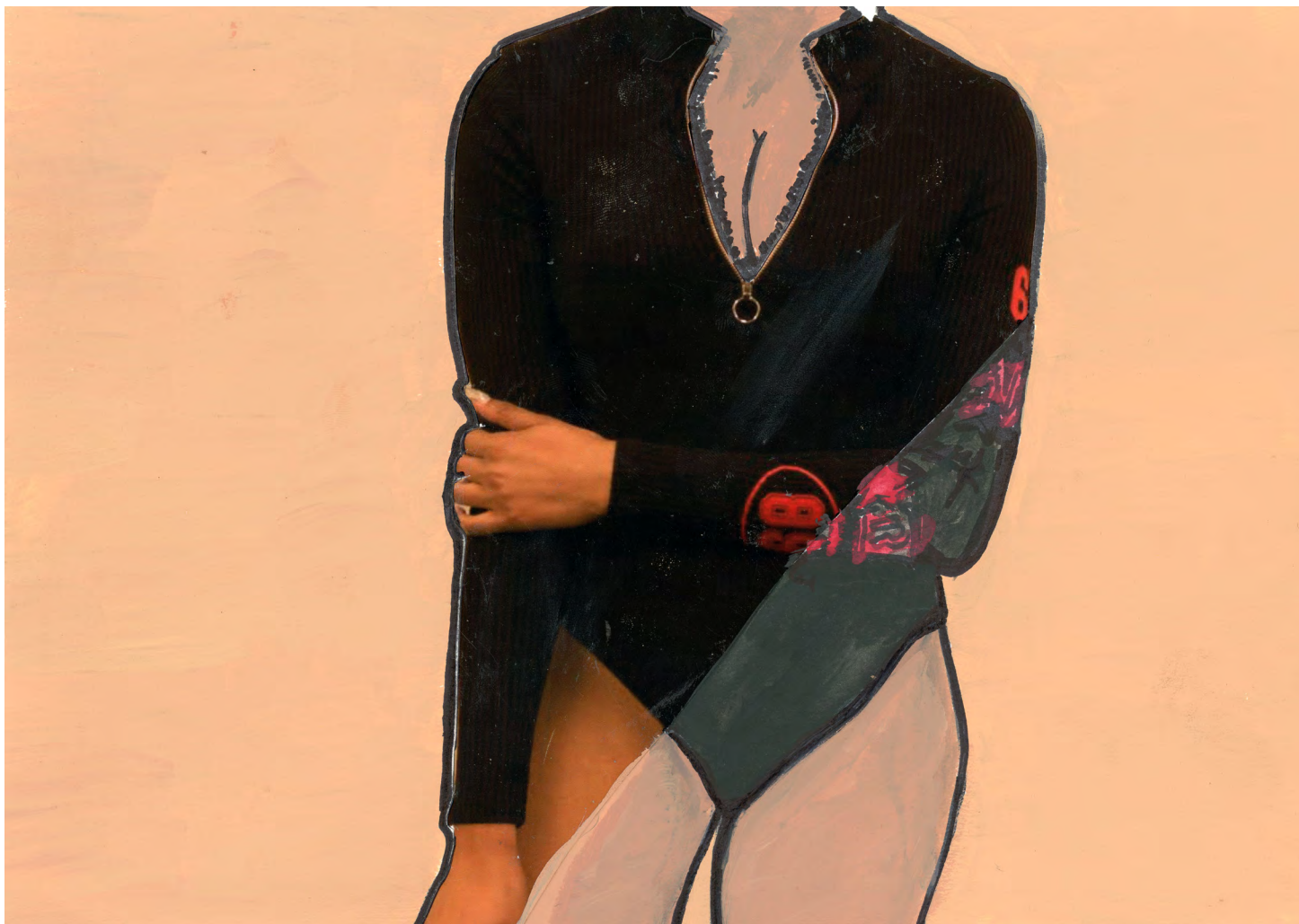
"Mind Control" (left) Acrylic on paper and inkjet print 12 x 16.5 inches