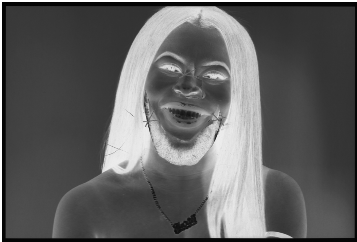
"Untitled" Inkjet print on transparency 16 x 8.5 inches each