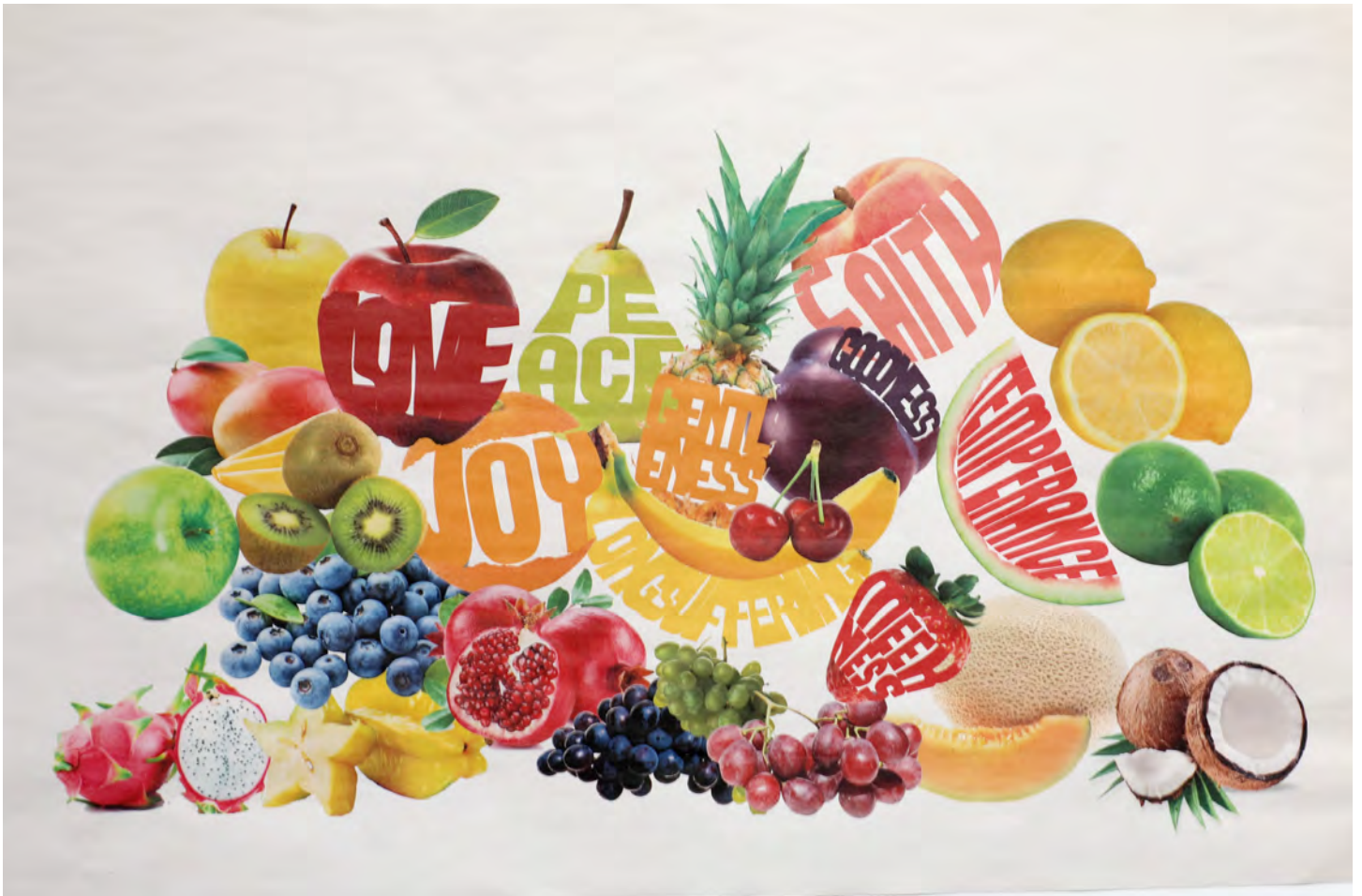
"Fruit of the Spirit" Inkjet on newsprint 36 x 24 inches