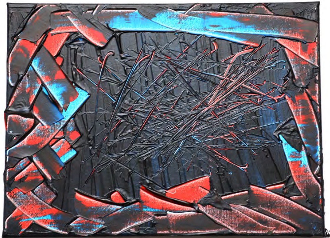
"Underneath" "Responsibility" Acrylic on canvas 16 x 12 inches each