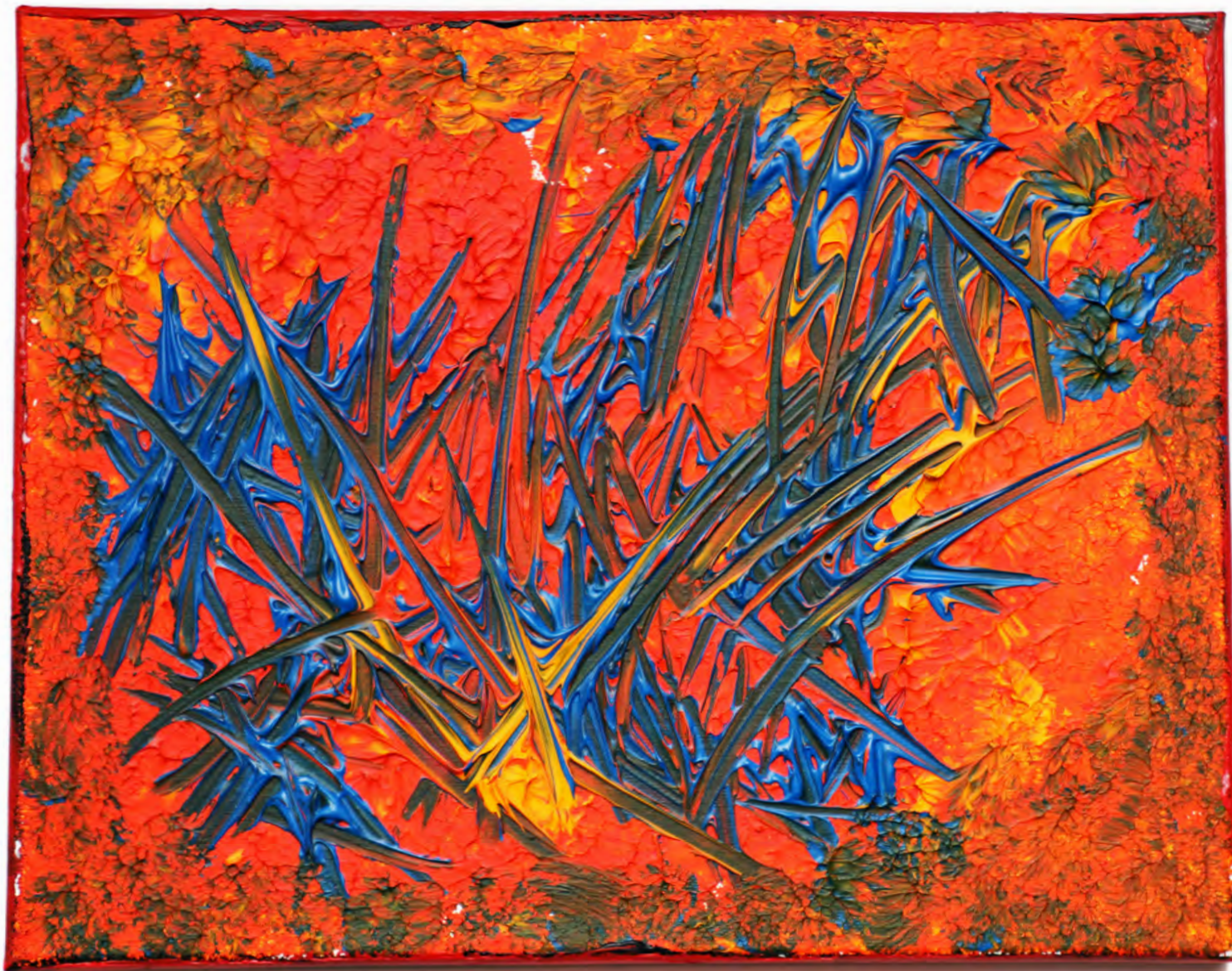
"Elements" (above) Acrylic on canvas 14 x 11 inches

Following page: "Backseat Art" "Obscured View" "Toxic" Acrylic on canvas 16 x 12 inches each