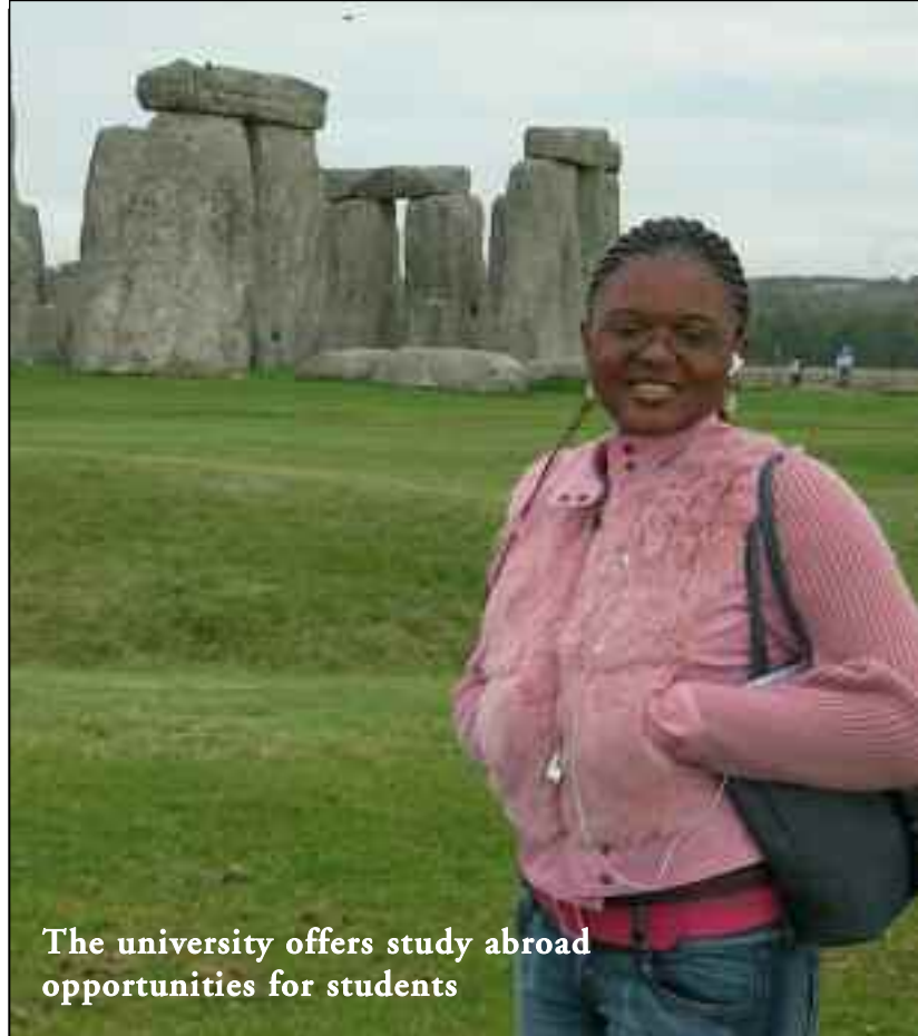
The university offers study abroad opportunities for students

The year represented another step in sustained determination by the division to make Lincoln University one of the most student-centered campuses in the nation.