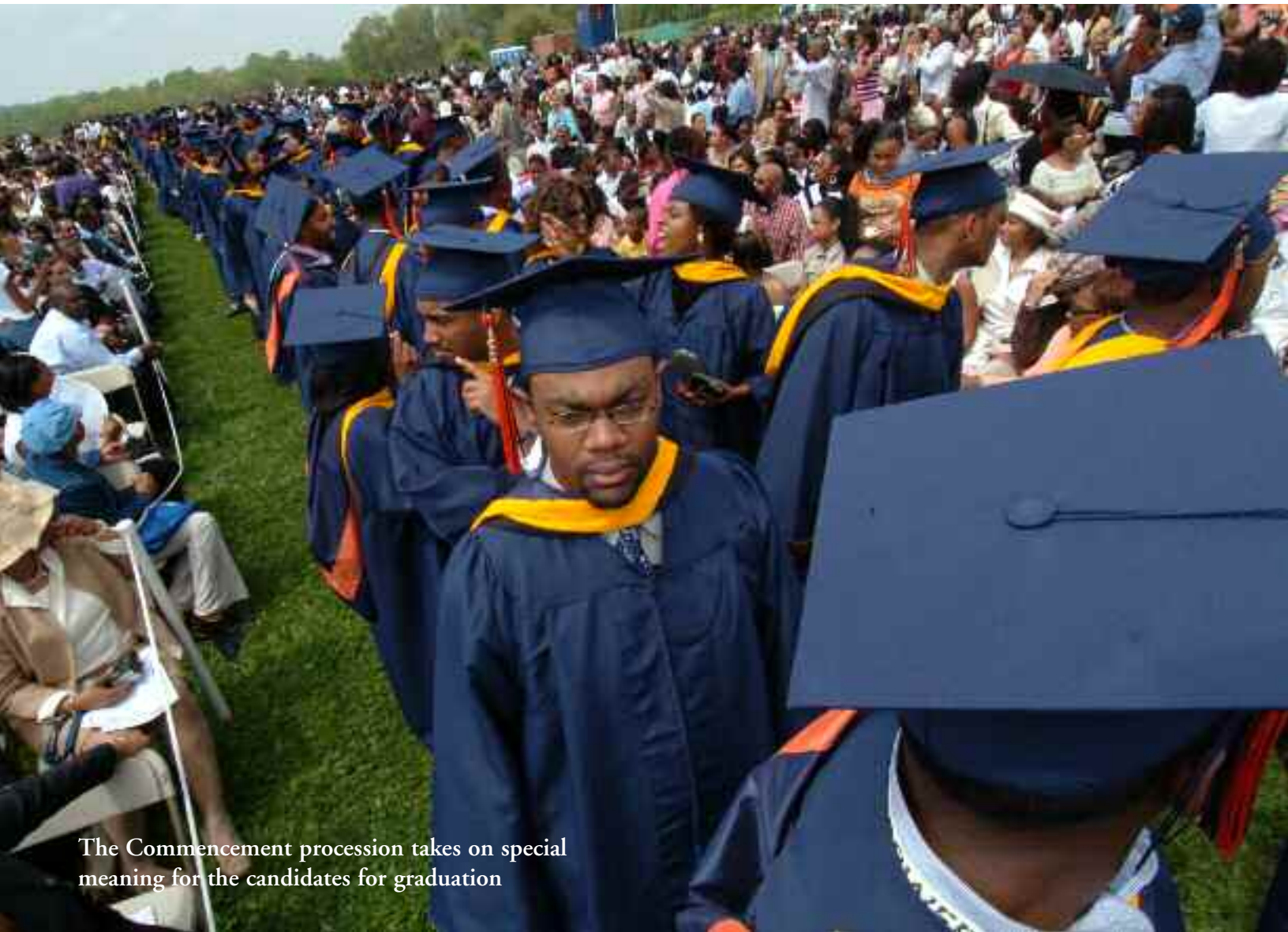
The Commencement procession takes on special meaning for the candidates for graduation